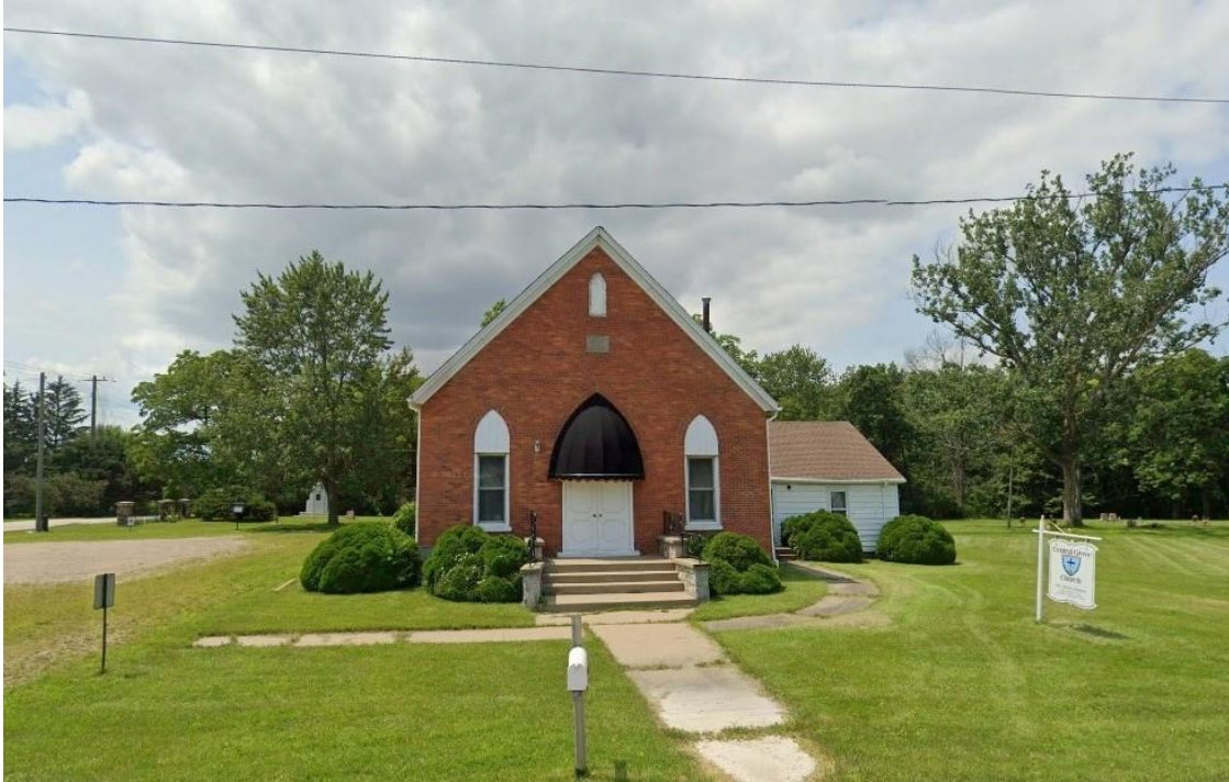
Central Grove African Methodist Episcopal Church in Harrow

Bill 23, More Homes Built Faster Act, passed November 28 2022, requires that all non-designated properties which were listed on your municipal heritage register as of December 31 2022 must be fully designated or else removed from the register by January 1 2025.